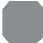
PERSONALISED LARGE FACETED SQUARE LOCKET NECKLACE W:19mm H:19mm