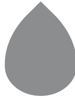
PERSONALISED LARGE DROPLET LOCKET NECKLACE W:19mm H:25mm