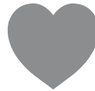
PERSONALISED HEART LOCKET NECKLACE & HEART DIAMOND LOCKET W:17mm H:16mm